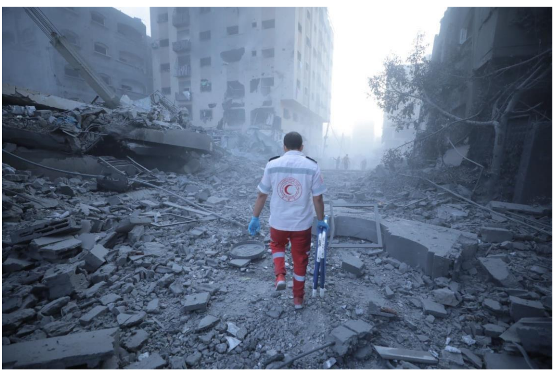
A PRCS EMT making his way through the rubble to provide the emergency medical services to the affected population from the continues bombardment.

<u>Note</u>: While PRCS keeps close coordination with the various partners and stakeholders; it is worth noting that PRCS Emergency Appeal is an independent appeal, that is not part of any regional or inter-agency appeal.