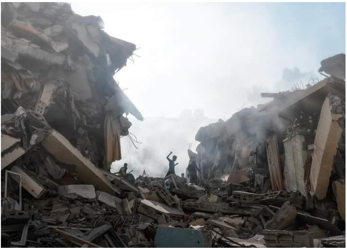
The scene of devastation caused by the Israeli airstrikes targeting on Gaza Strip.